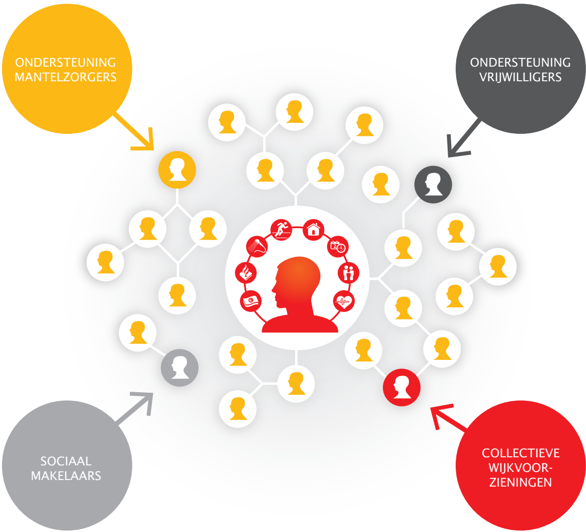
Ondersteuning van het zelforganiserend vermogen (Spoor 1)